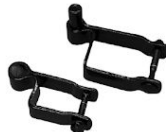
STANDARD SQUARE HINGE SET

WWW.MALDENMETALS.CA INFO@MALDENMETALS.CA