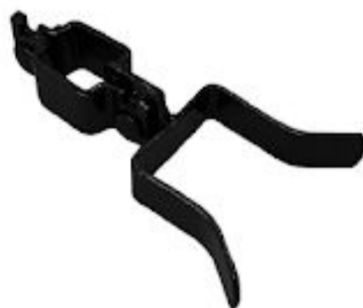
FORK LATCH ASSEMBLY